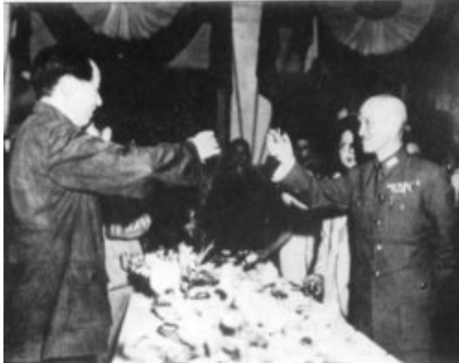
Source 4: Mao and Chiang toast broad agreement at the peace talks in Chongqing

ordered the Communists to hand over the cities in Manchuria to the Nationalists.